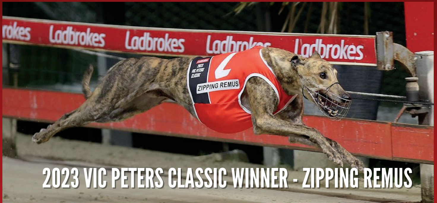
2023 VIC PETERS CLASSIC WINNER - ZIPPING REMUS