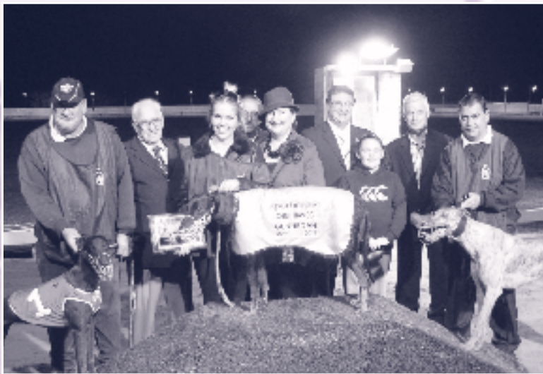
Chief Havoc Gunnedah Cup 2014. Winner: Glenreagh Rocket.