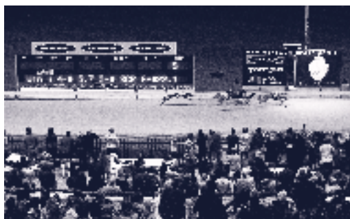
Top: 2014 Macro Meats Golden Easter Egg Presentation.