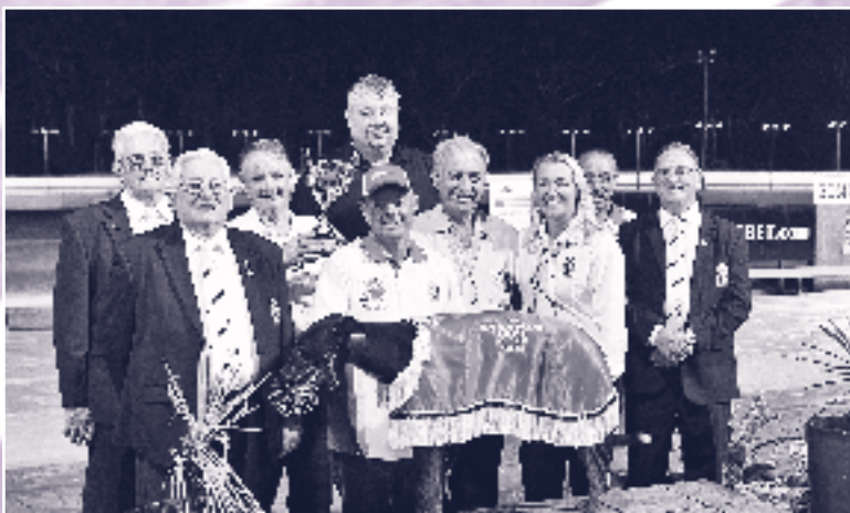
Woy Woy Poultry Supplies Gosford Gold Cup. Winner: Awesome Project.