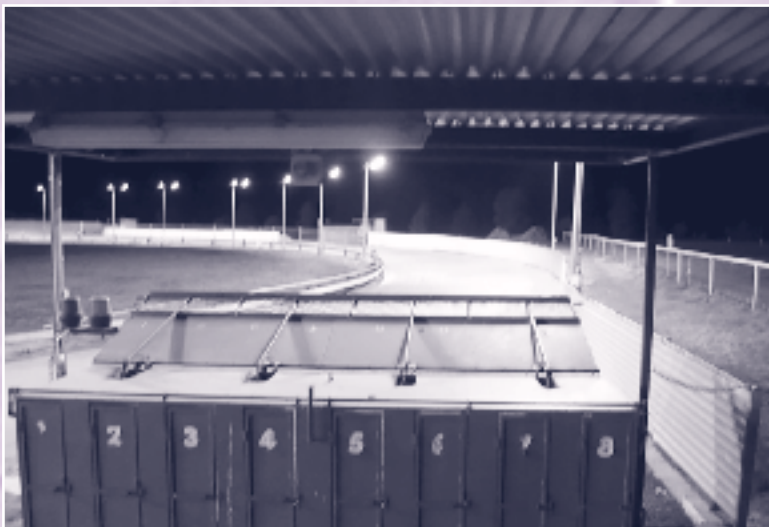
A total of 2,500 hours of volunteer labour went into converting the Temora greyhound track from grass to loam August 2013.