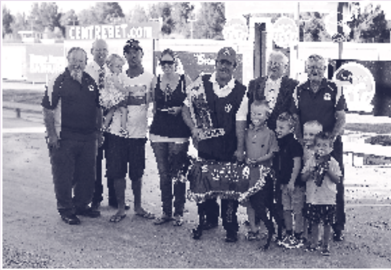
2013 Bathurst RSL Soldiers Saddle. Winner: Jack's Joker.